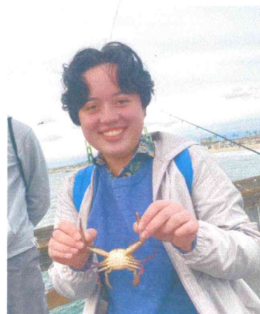
Crabbing with Ecology students at Newport Beach