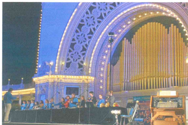
Concert Handbells performing at the Spreckels Organ Pavilion in San Diego