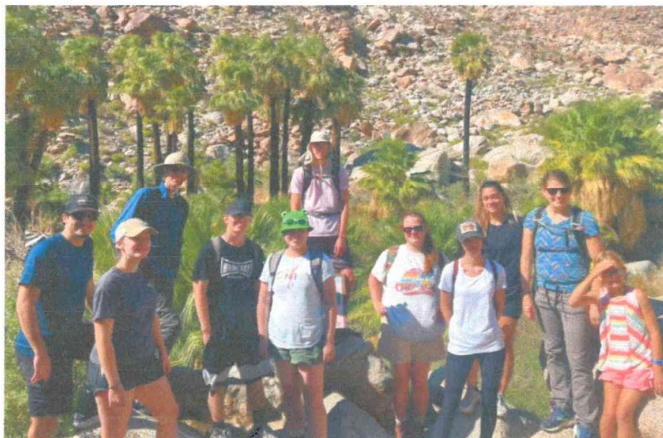
Field Biology Techniques research trip to Anza-Borrego Desert Research Station